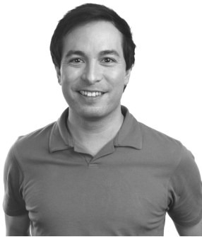
1. Jeff social networking sites cell phone

A What methods of communication do these people use? Watch the video and circle the one that is mentioned.