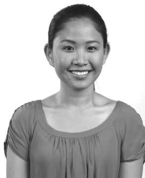
4. Sarah instant messaging text messages