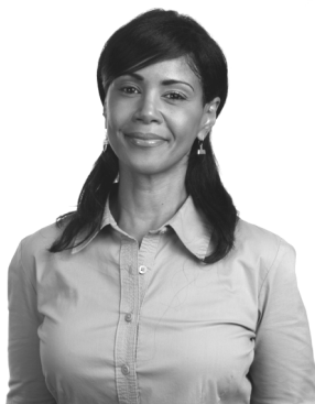
2. Victoria instant messaging e-mail